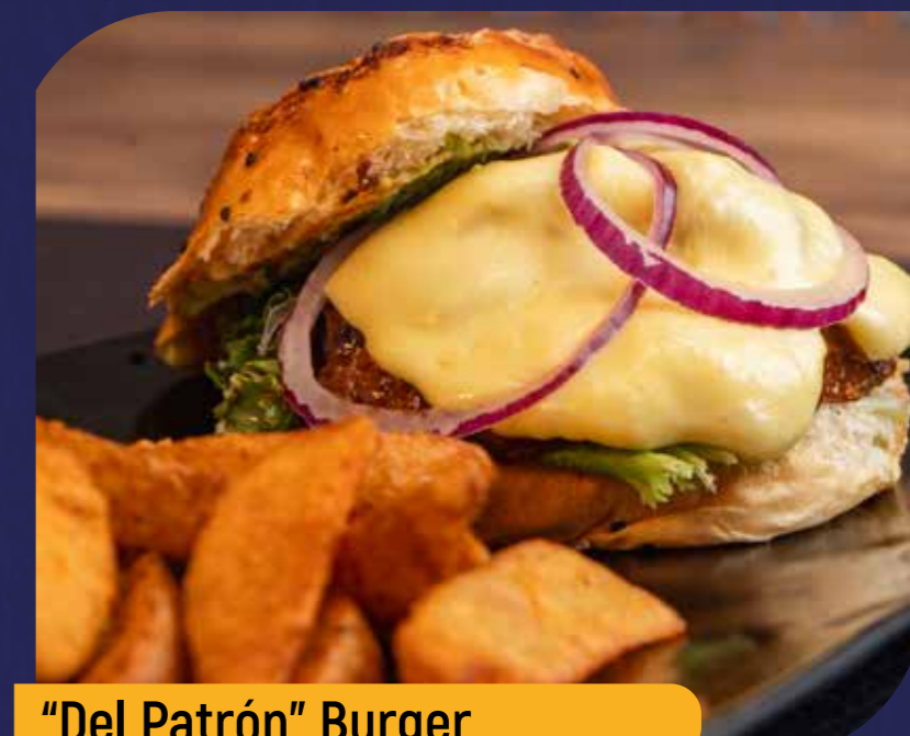
“Del Patrón” Burger

*All our prices are in national currency and include 16% of VAT. Forms or payment: Cash, credit or debit cards, Visa and Mastercard.