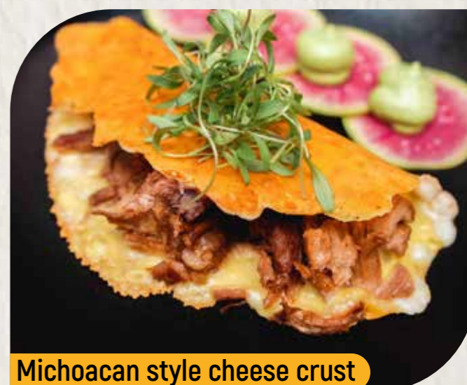
Michoacan style cheese crust